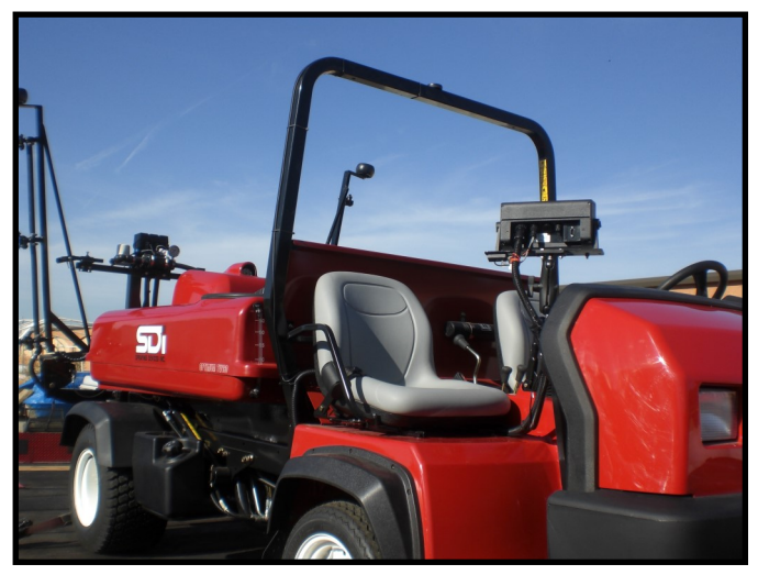
TW160 with Diaphragm Pump