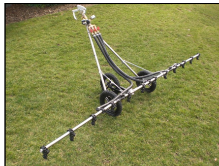
Turf Walker 10