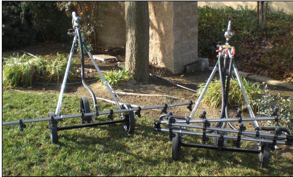
Turf Walker 6.5 and Turf Walker 10 (folded)

Whether you are spraying a large area or small area, SDI builds a Turf Walker to fit your needs.