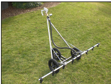
Turf Walker 6.5