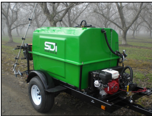
TM500 with Highway Trailer

Turf N' Tree from SDI, the only sprayer you will ever need!