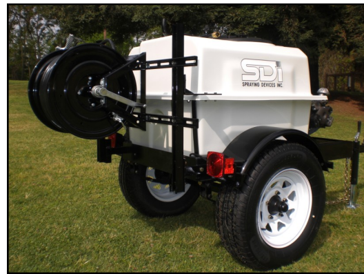
TM100 with Highway Trailer & Vertical Hose Reel

Spraying Devices Inc. • 447 E. Caldwell Ave • Visalia, CA 93277