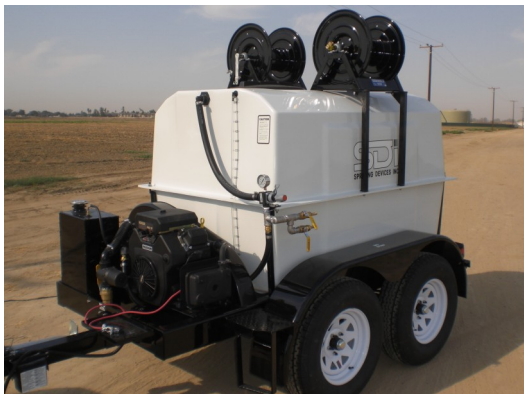
TM500 with Tandem Axle Highway Trailer

(other pump and engine combinations are available)