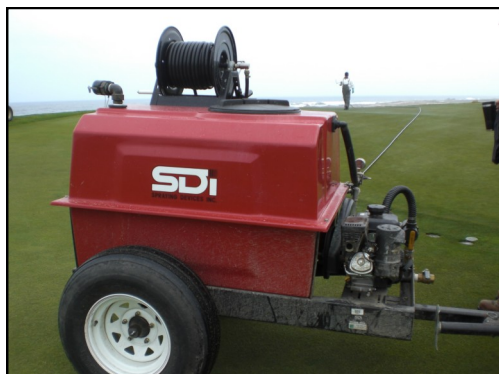
200 Gallon with High Flotation Trailer Package