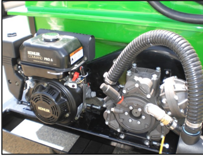
Kohler® engine and Comet® Pump

The SDI Turf N' Tree sprayer combines your choice of a Honda GX™ or Kohler® Command Pro engine with a 20 gpm Comet® diaphragm pump. This package gives you the dependability, efficiency, economy and pumping characteristics that will fit the majority of your needs.