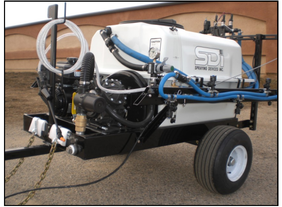
TM100 with available Turf Trailer Package and Accessories

range of liquids with various viscosities.