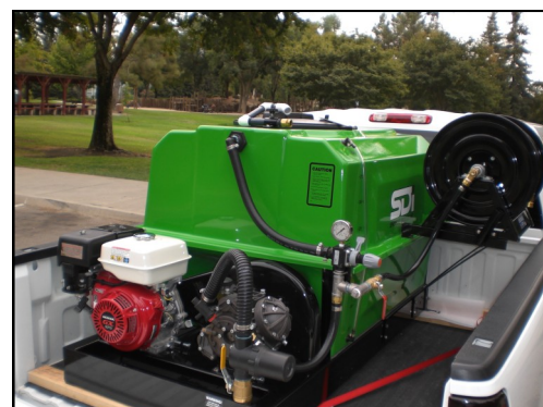
TM200 Skid with Side Mount Hose Reel