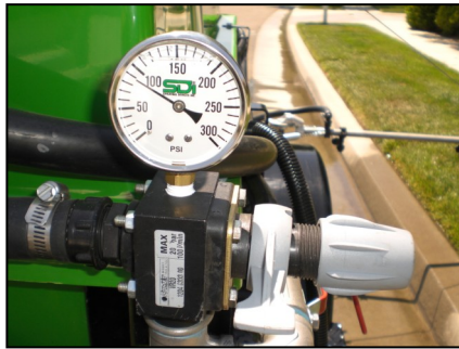
Liquid Filled Pressure Gauge & Regulator

The pressure regulating valve has a micrometer style knob and liquid filled pressure gauge to accurately adjust to high or low spraying pressures. It also features a “quick-unload” feature for easy engine starting.